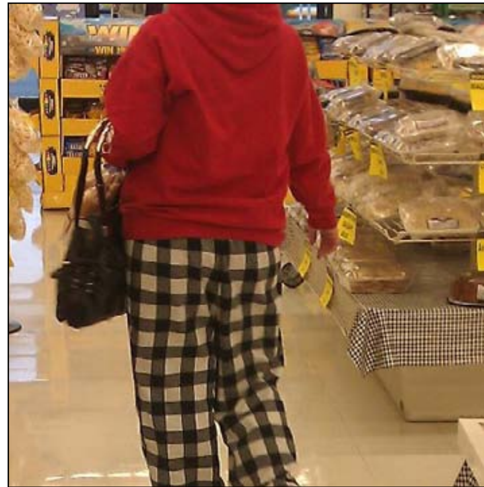
The new Caddo Parish pajama resolution encourages businesses to implement dress codes that would prevent customers from wearing sleepwear while shopping.

The pajama ban is a resolution, not a law. It will be up to businesses to implement the dress code through their own policies.